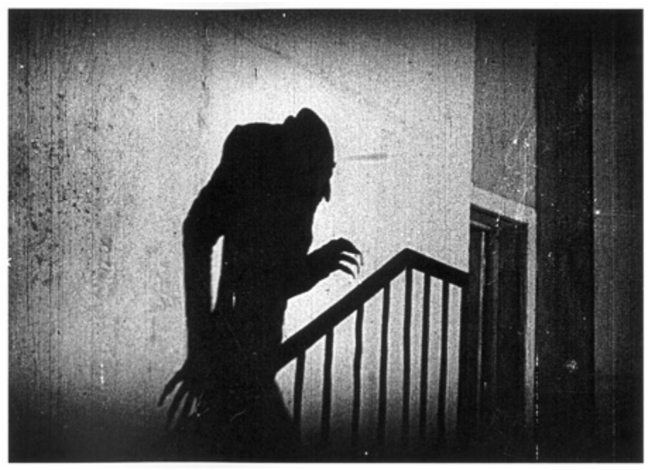
Above is the original shadow from the 1922 film Nosferatu.