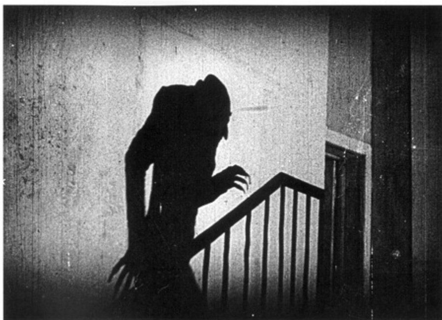
Above is the original shadow from the 1922 film Nosferatu .

Safety Note: Candles should be used only under adult supervision, and should never be left unattended.